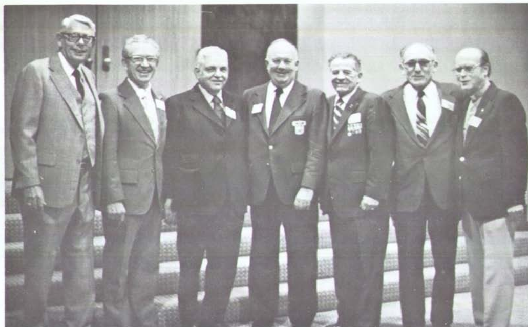
VBOB OFFICERS 1982-83