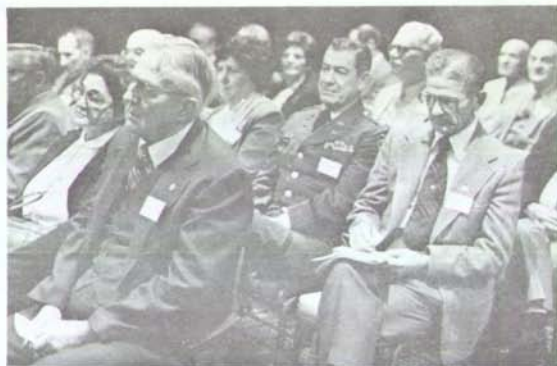
Panorama view of group listening at General Meeting.