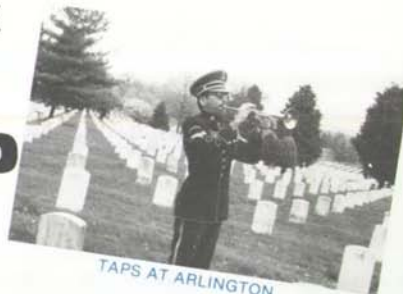
TAPS AT ARLINGTON