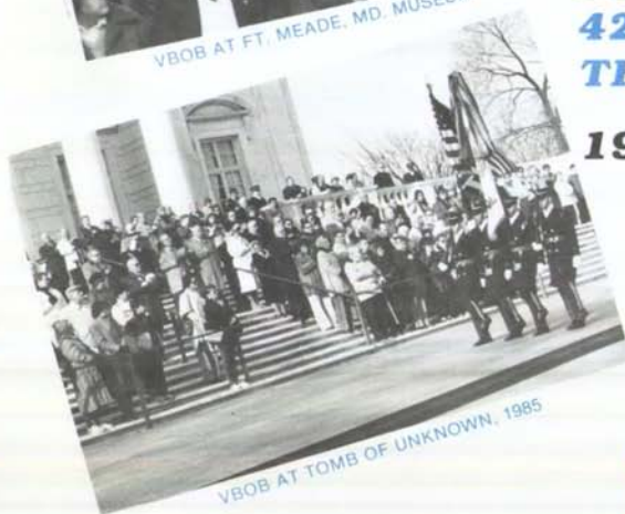
VBOB AT TOMB OF UNKNOWN, 1985