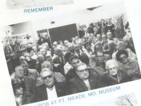
VBOB AT FT. MEADE, MD. MUSEUM