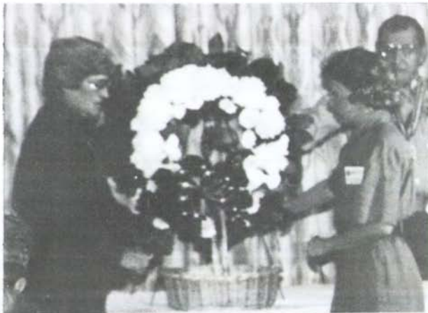
MEMORIAL SERVICE-GM Meeting.