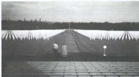
American Cemetery at Neuville-En-Condroz