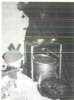
Diekirch Museum Diorama GI Christmas Turkey Dinner