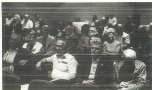
7th General Membership Meeting Attendees