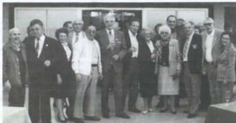
VBOB Members Enjoying Tour