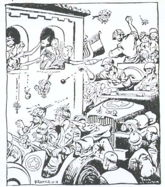
"My, sir - what an enthusiastic welcome!"

Beast do not fight collectively. Who has ever seen ten lions fight ten bulls? Yet how often do 20,000 armed Christians fight 20,000 armed Christians?