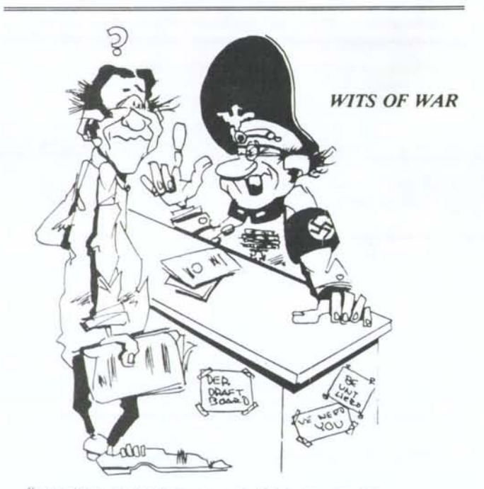
"YOU'RE EXEMPT IF YOU'RE OVER 65 AND HAVE PROOF YOUR FATHER IS AT THE FRONT."

Tonight, the Second Armored Division still goes forward. Since the breakthrough they have taken 1,700 prisoners, killed 3,500 Germans, smashed or captured 110 tanks. They carry with then a special congratulation from Field Marshal Montgomery. They are Americans at their most magnificent.