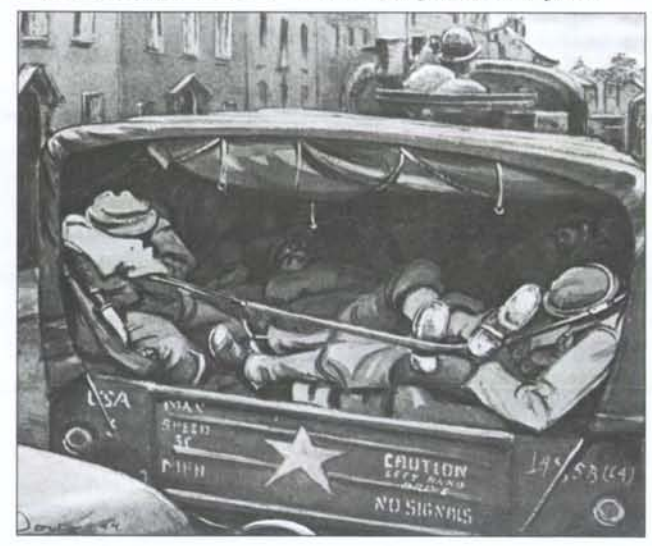
Truck Ride gives these soldiers a chance for a much needed nap before going on a new attack.

has become a more common sight than before