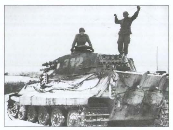
A King Tiger is used as a signal pole by men of the 82<sup>nd</sup> Airborne Division.

Further up the road we were quartered in another barn and I was sent back for more ammunition with another man. As we approached the side entrance to this barn a sniper opened fire on us. My buddy was closest to the door and should have been the poorest target while I was more exposed but fate would have ithe was shot in the stomach as he turned to enter the barn. At first it didn't appear to be fatal but on turning him over we saw the gaping hole in his back and he was gone within minutes. That was the closest I came to leaving this earth and made me realize how lucky a person could be.